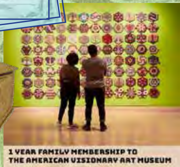
1 YEAR FAMILY MEMBERSHIP TO THE AMERICAN VISIONARY ART MUSEUM